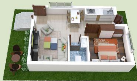
1 BHK VILLA