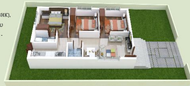
3 BHK VILLA

EXPANDABLE VILLAS, KUMBAKONAM (2 & 3 BHK), VAASTU-COMPLIANT HOMES. DTCP APPROVED LAYOUT; PROVISION FOR ADDITIONAL SPACE - EXPAND ANY TIME LATER, AS YOUR FAMILY GROWS