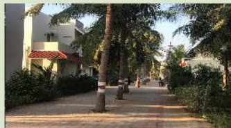
STREET LIGHT AND PAVER ROAD