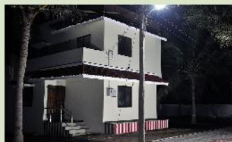
2BHK DUPLEX VILLA NIGHT VIEW