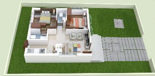
2 BHK VILLA

EXPANDABLE VILLAS, KUMBAKONAM (2 & 3 BHK), VAASTU-COMPLIANT HOMES. DTCP APPROVED LAYOUT; PROVISION FOR ADDITIONAL SPACE - EXPAND ANY TIME LATER, AS YOUR FAMILY GROWS