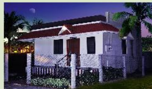
NIGHT VIEW VILLA