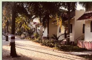
MORNING VIEW OF SITE